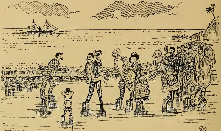
THE FOREIGN VISITORS.

rapidly than usual this calm evening. The blood-red sun, which we had all contemplated with joy and admiration from our family tree-top, as its shining orb hovered above the water-line, loth to sink to rest, suddenly sank out of sight. The stars all rushed out and shone with a brilliancy that again moved me to tears. When I had recovered sufficiently to rise from the ground, which was getting damp, I pursued my way back through the forest to our home, where all now were silent in innocent and happy sleep. I climbed the stairs so rapidly that I fell down again, and had to repeat the operation of going up again, though most reluctantly. The noise I made awoke Ernest, who was always a light sleeper, and he asked me what was the matter.